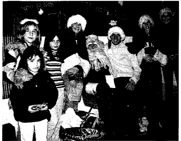
Santa and friends