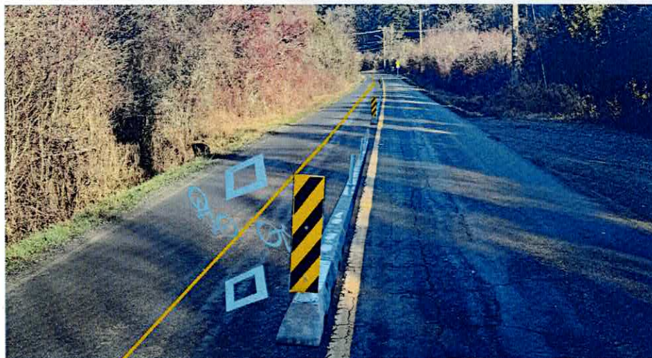
North bound vehicles only with bidirectional multi-use trail