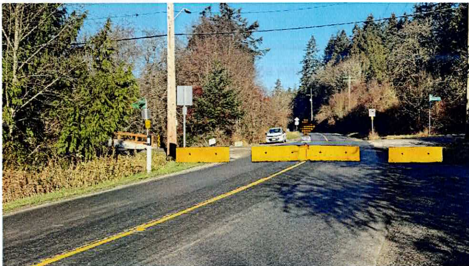
Full closure south of Durrance Road